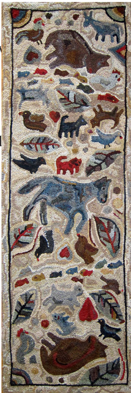
Barnyard with Fishes — Adaptation of Magdalena antique

Today, hooked rug artists have at their disposal an amazing array of hooks, frames, patterns and backings and cutters. New devotees are eagerly joining this tradition at an amazing pace. The Association of Traditional Hooking Artists (ATHA) exists to help you discover why so many people want to get in the loop.