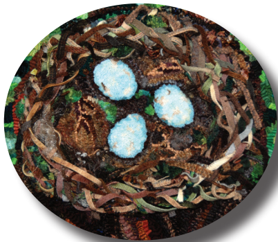
Perfect Day (detail) Design adapted by Norma Batastini Hooked by Ellen DiClemente